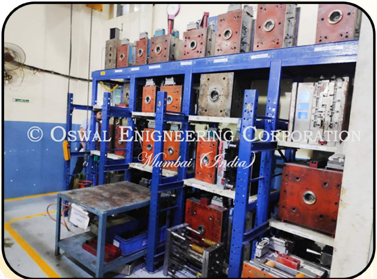
ACTUAL IMAGE AT CLIENT'S SITE

The racks also helped them clear client audit remarks, improve company image and adhere to 5S & lean manufacturing techniques.