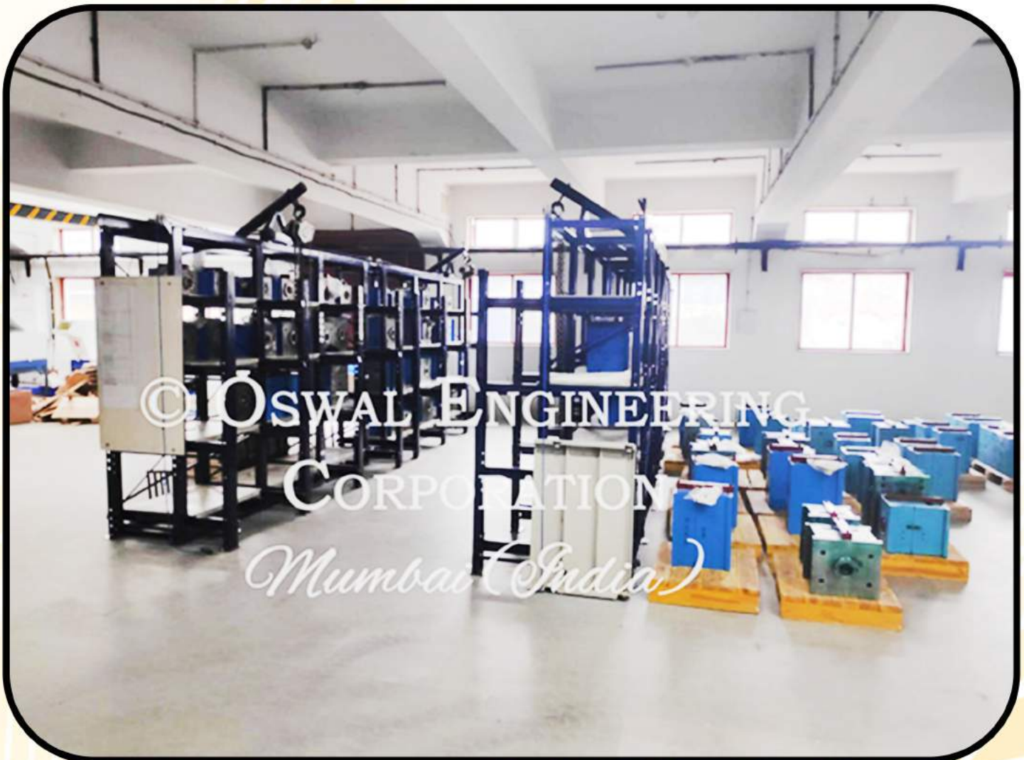
ACTUAL IMAGE AT CLIENT'S SITE

Example, 24 Moulds/dies of 450mm (L) x 450mm (W) x 400mm (H) [average] when kept packed together on floor will require 4.86 sq. m. (Approx. 52 sq. ft.). Same number of moulds can fit in our racks (Medium duty) with protection and easily retrieval system in just 3.13 sq. m. (approx. 33 sq. ft.). Space saving of 1.7 sq. m. (approx. 18 sq. ft.) that is 36% savings.